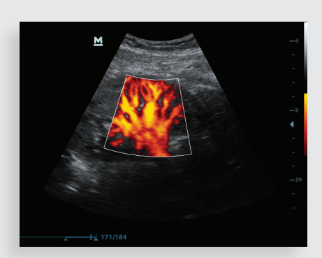
Power Doppler of Kidney